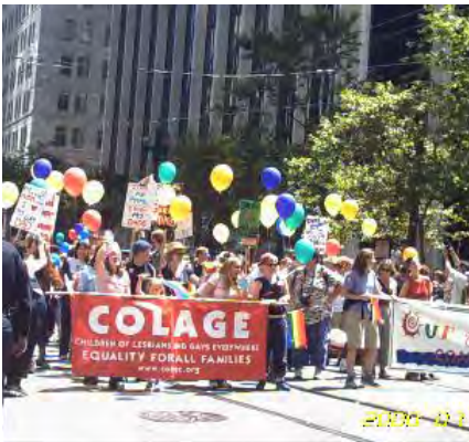
San Francisco Pride Parade

Join us in 2009 as we return to San Francisco for DignityUSA’s 19th Biennial Convention where we will celebrate 40 years of ministry to the LGBT Catholic community. Come early and join in the San Francisco Pride celebration happening the weekend before the convention. Show your Pride by joining Dignity’s 40th Anniversary Pride Parade Contingent.