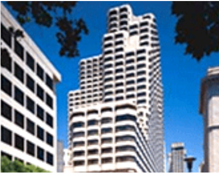
Parc 55 Hotel San Francisco

Convention 2009— Celebrating 40 Years of Ministry to GLBT Catholics DignityUSA Convention, July 2-5, 2009 Parc 55 Hotel, Union Square, San Francisco