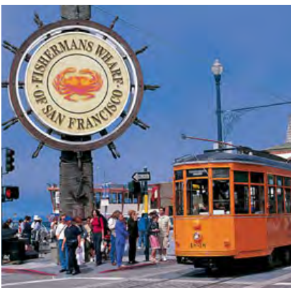
F-Line at Fishermans Wharf

The Parc 55 Hotel, located in the city’s financial district and next to the Union Square shopping area and theater districts, will serve as the convention site. Handy public transportation is available. The Convention Committee has secured room rates of $119 per night for single/double, plus $20 each for the 3rd and 4th person (plus room tax). Kids under 12 are free.